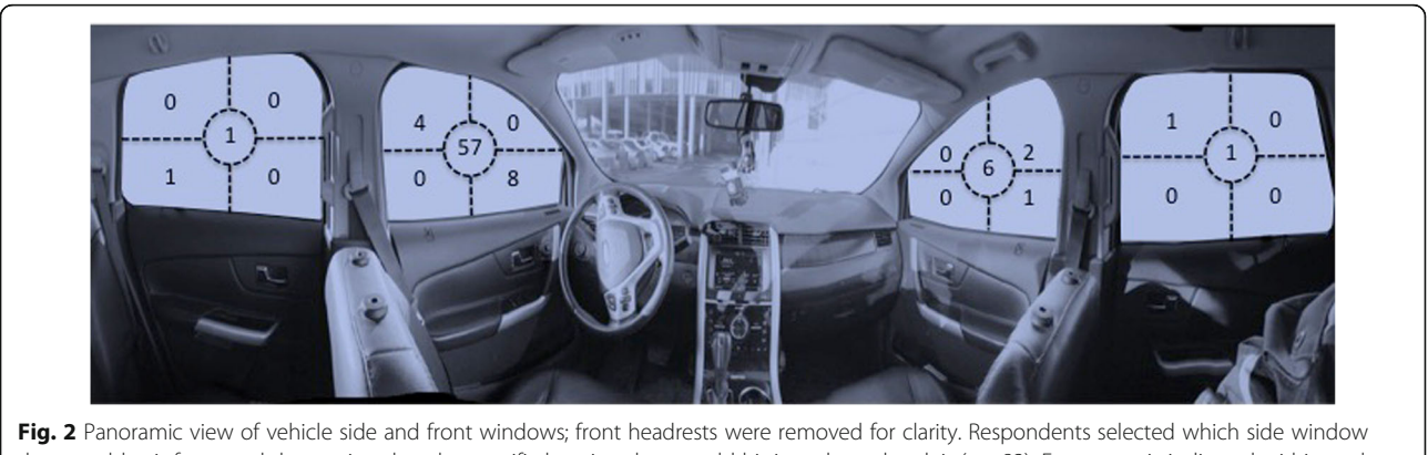
they would exit from, and then pointed to the specific location they would hit in order to break it (n = 82). Frequency is indicated within each window-area section (e.g., 4 corners and the center)

decision making, result in instinctive decisions and behaviour (Giesbrecht 2005). These decisions often result in unsafe or erroneous actions (Reason 1992) due to factors such as relying on incorrect information; rejecting or misapplying correct information; or choosing inappropriate actions (including doing nothing). Education