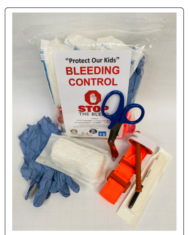
Fig. 3 Hemorrhage control kits fabricated by the OHSU Trauma Program from materials purchased in bulk – $122/kit: 4 x North American Rescue Combat Tourniquets – $29/tourniquet. 4 x large gloves. 4 x packages of gauze. 1 x utility scissor. 1 x surgical marker

This study illustrates the importance of collaboration between trauma centers, law enforcement and schools, and the feasibility, ease and effectiveness of administering Stop the Bleed to school staff. The ability to deliver this program to over 1000 educators serving a population of almost 10,000 students is a model for other trauma programs. The initial investment in hemorrhage control kits is a minor expense compared to the potential number of lives saved.